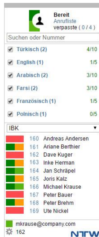
Contact center functionality containing queue and group overview